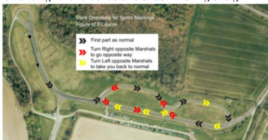
Curborough Figure of 8 Track Direction Guide